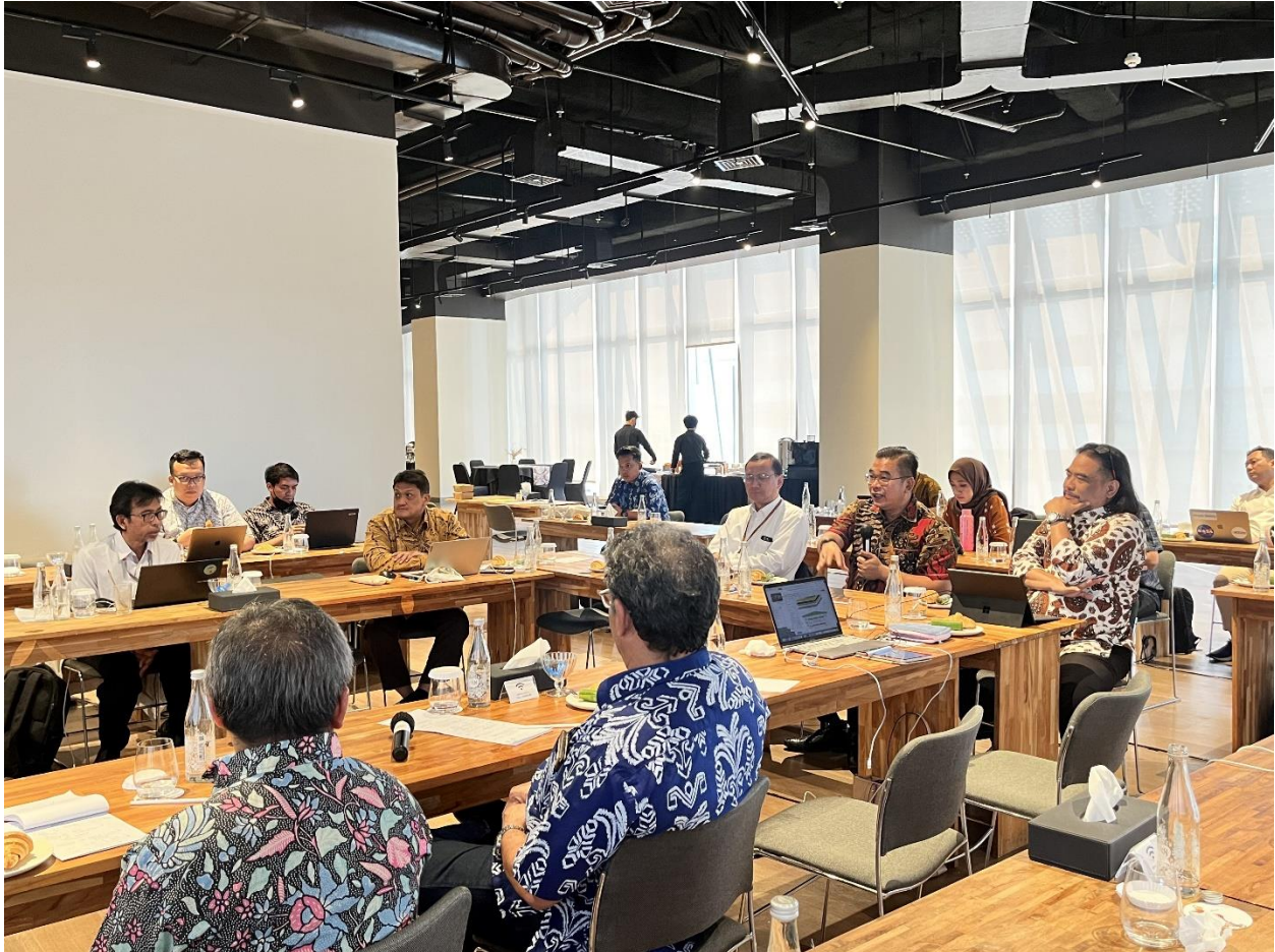
PHOTO DOCUMENTATION